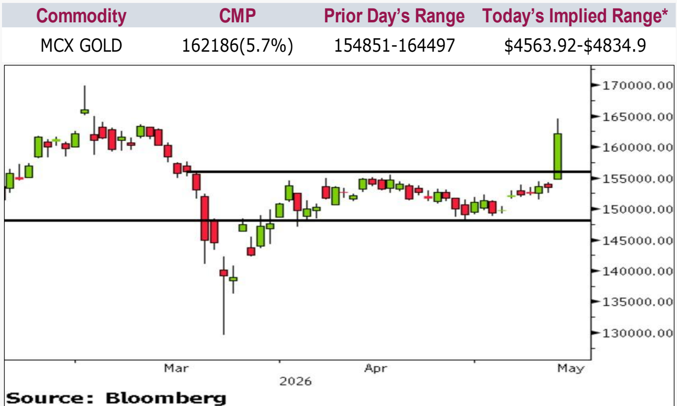
Implied range is for the Comex front-month futures